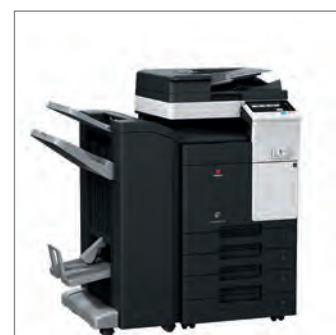
The d-Color MF283 equipped with a DF-628 Document Feeder, FS-534SD Finisher and PC-214 Trays