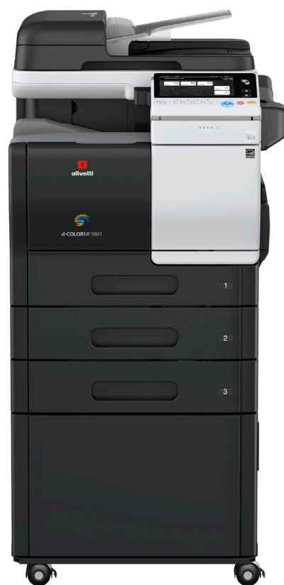
Configuration with 2 optional Paper Drawers and Copy Desk