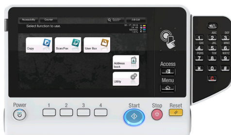
Innovative 7" Multi-touch Display Panel with NFC authentication area and optional Keypad (KP-101)