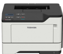
e-STUDIO408P standard configuration