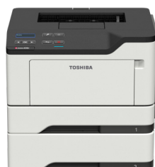
e-STUDIO408P w/ 550-sheet Drawer