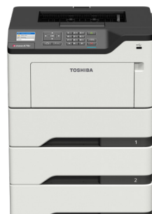
e-STUDIO478P w/ 2x 550-sheet Drawer