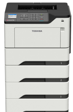
e-STUDIO478P w/ 3x 550-sheet Drawer