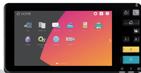
Customised to display up to 18 icons per page and with a different background

Mobile Printing connects these systems with your mobile devices via AirPrint, Google Cloud Print or the Mopria Print Service.