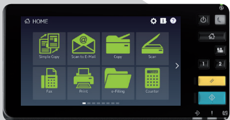
Display icons as buttons to easily access functions or start workflows.